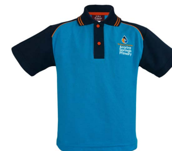
Senior Polo Shirt