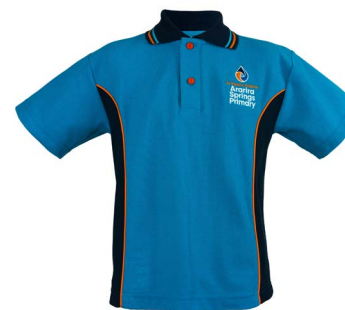
Junior Polo Shirt